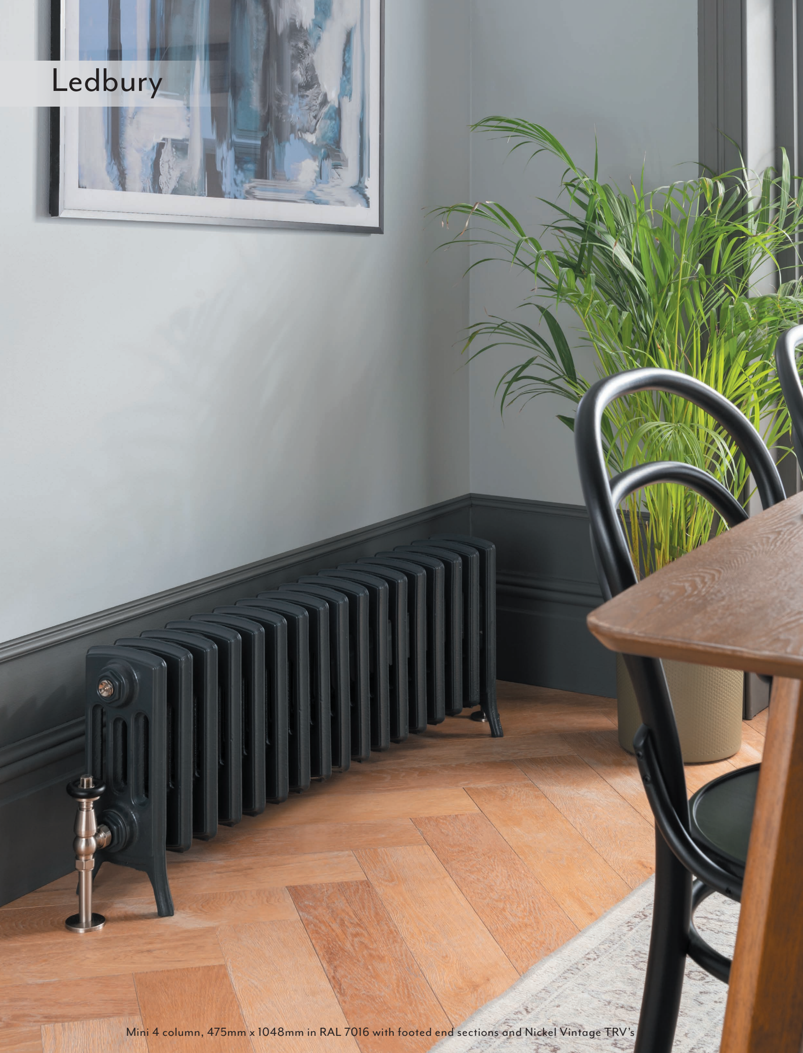
Mini 4 column, 475mm x 1048mm in RAL 7016 with footed end sections and Nickel Vintage TRV's