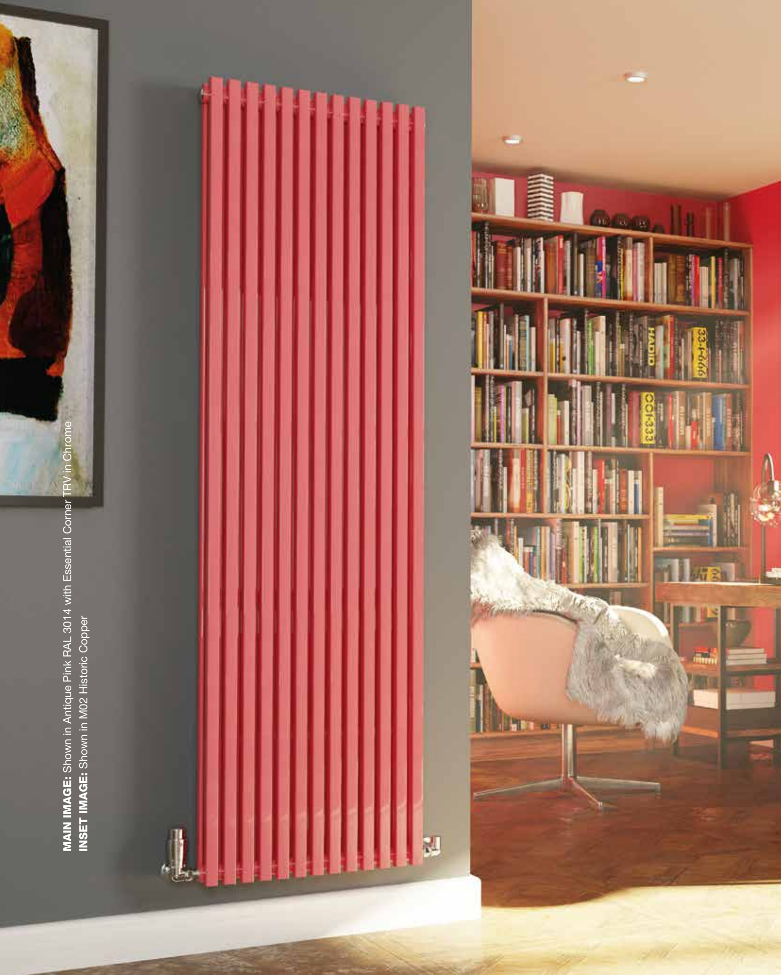
MAIN IMAGE: Shown in Antique Pink RAL 3014 with Essential Corner TRV in Chrome INSET IMAGE: Shown in M02 Historic Copper